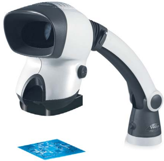
Mantis Elite UV with swing away boom mount for added flexibility

Mantis Elite UV is a variant of Vision Engineering's Mantis Elite stereo microscope, offering clear, magnified imaging of UV fluoresced cracks, flaws and coatings. Fault detection is made more effective by magnification highlighting minute cracks and pitting.