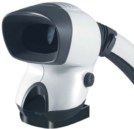
Eyepieceless optics increase operator head freedom, reducing fatigue

Mantis Elite utilises Vision Engineering's patented Expanded-Pupil technology to provide up to 10 times greater freedom of head movement than conventional binocular eyepiece microscopes.